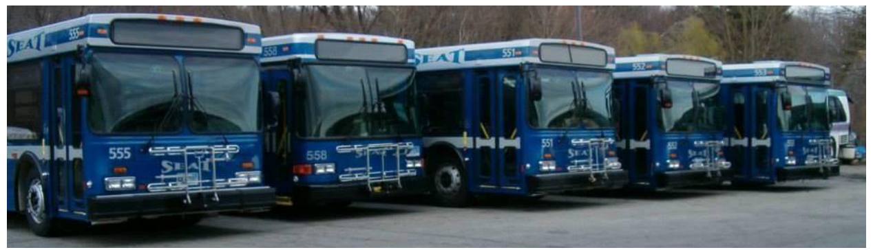
Southeast Area Transit, seatbus.com